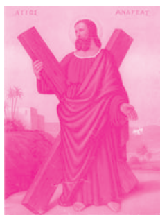
You Can Count on Me To Make Disciples